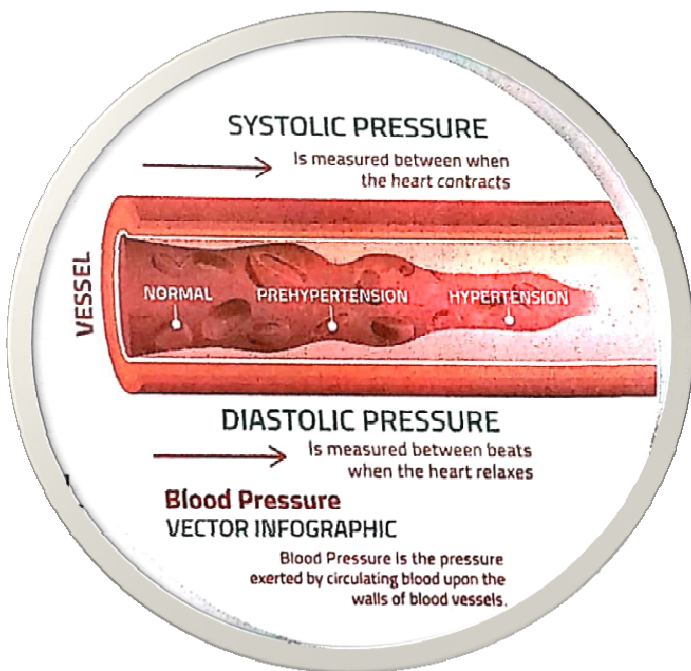
Fig 1: Credit Times of India report dated May 2018